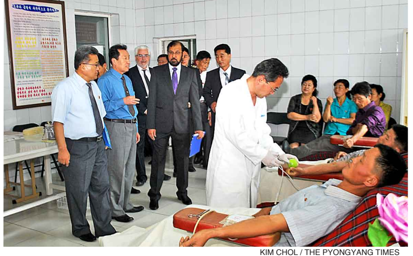
An event for World Blood Donor Day takes place at the National Blood