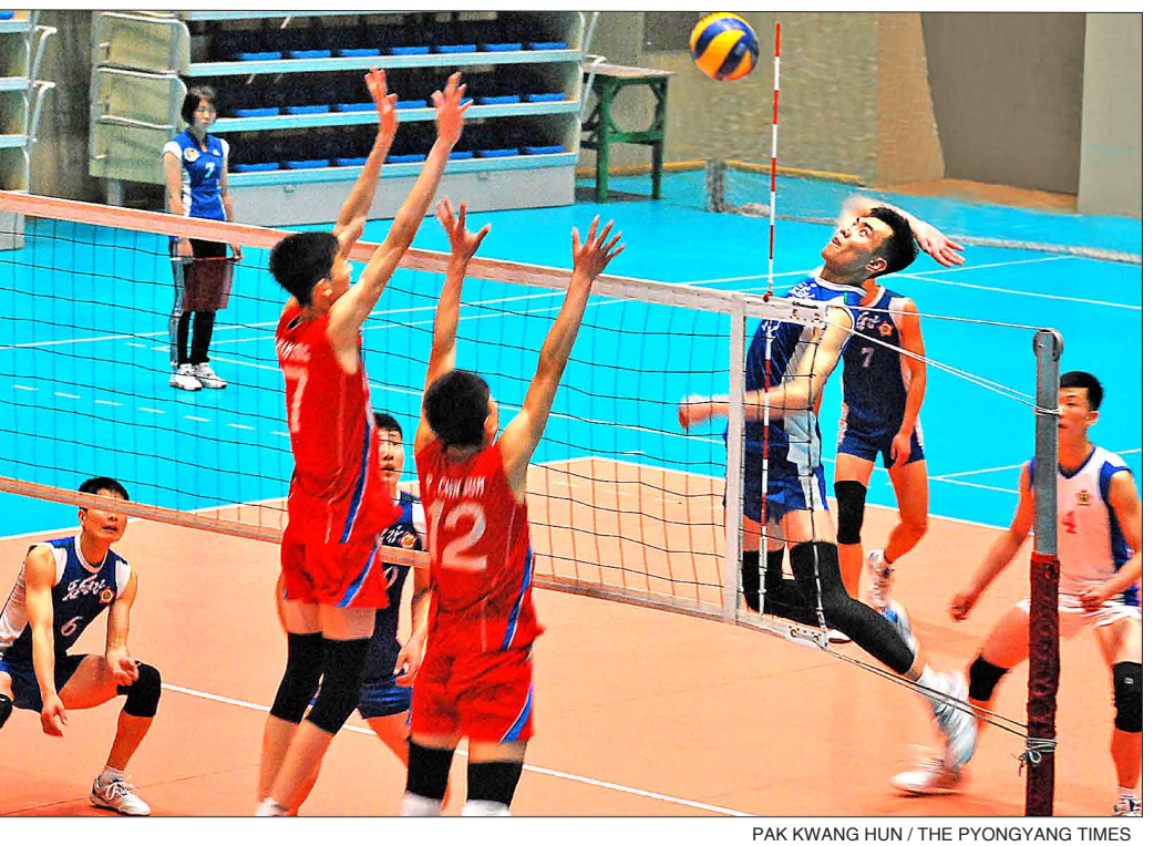
A scene from the match between April 25 and Amnokgang in the senior first-division volleyball competition.