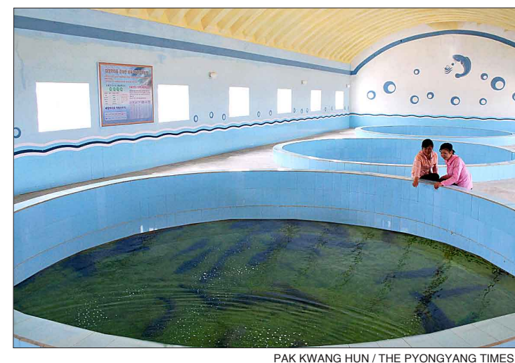
A catfish farm has been built in Rinsan County, North Hwanghae Province.

Rinsan County of North Hwanghae Province is a mountainous county, with mountains and forests covering 70 % of its cultivation area. As the Myorak Mountains stretch down the middle of the county, most of its farmland is the hills and strips of plains that are high. It has no large rivers and is far away from the sea, so fish which is abundant in the plain areas was considered a delicacy here. It was so rare that locals told old stories that their ancestors prepared sumptuous feasts of local specialities without fish.