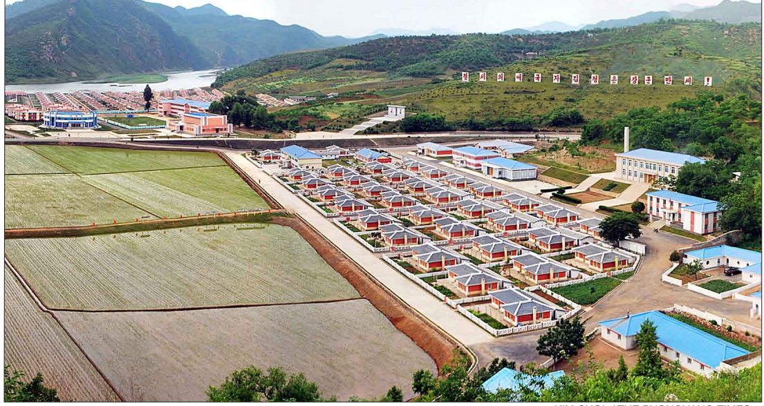
Renowned Poman-ri has been given a facelift.