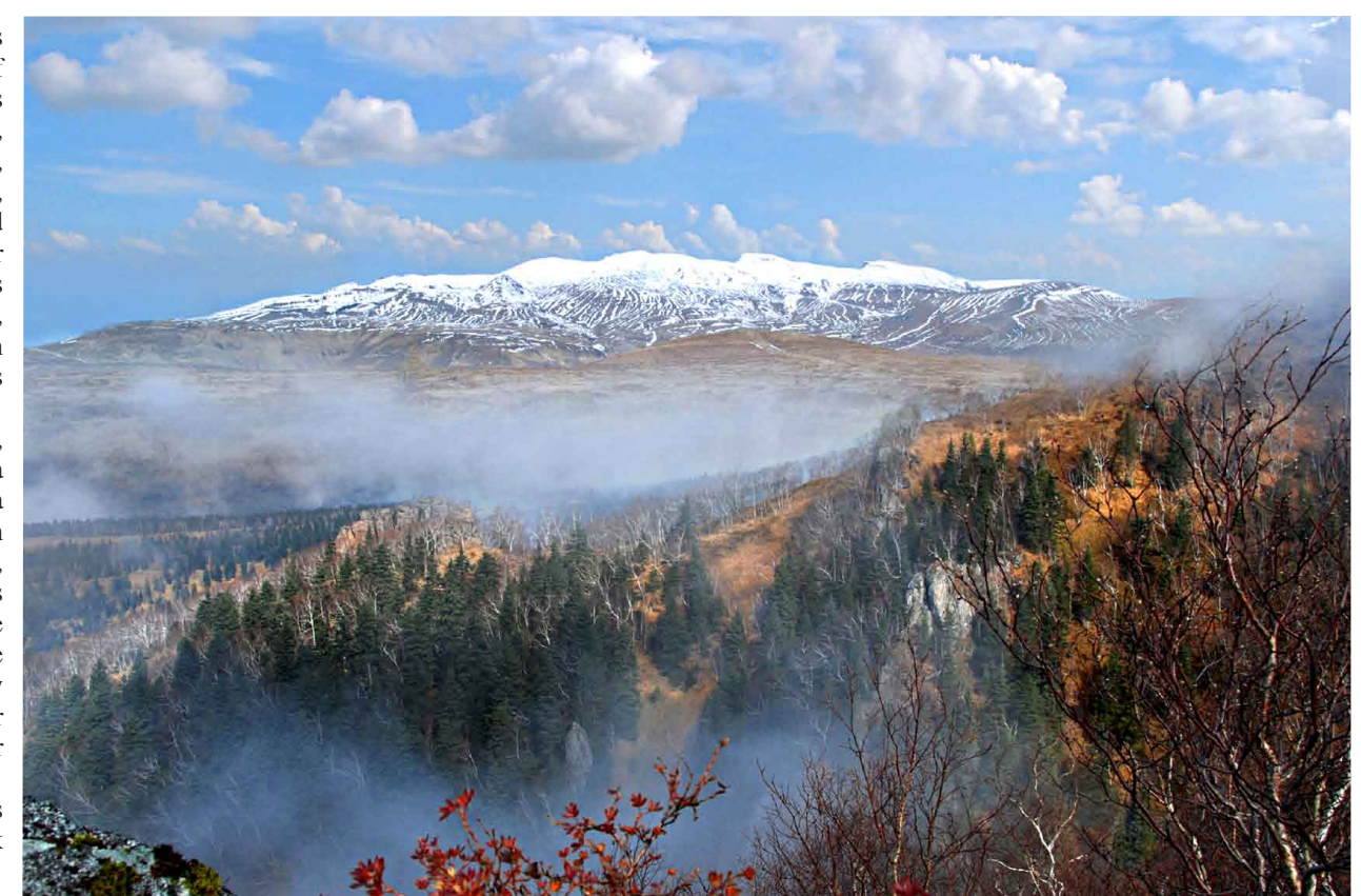
A distant view of snow-capped Mt Paektu.

Paektu, with a vast expanse of primeval forests stretching out below and shrouded in a cascade of clouds, is really a sight to behold.