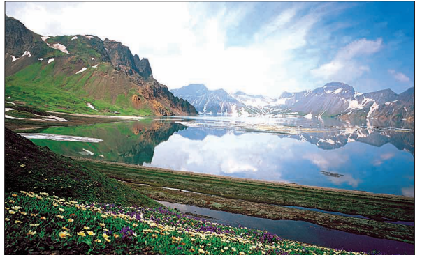
The shore of Lake Chon in summer.