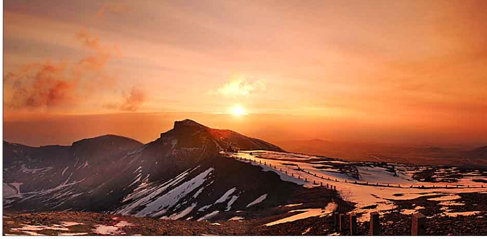
The sunrise on Mt Paektu.