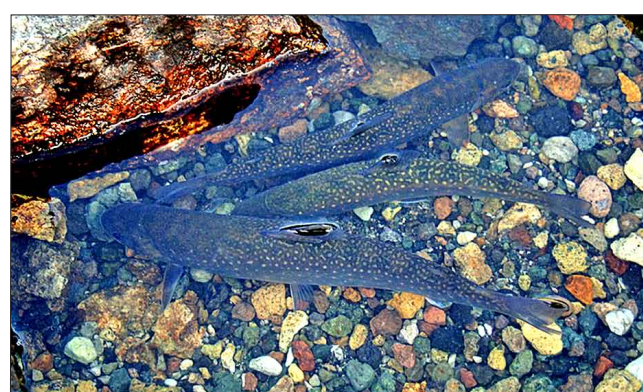
Char inhabiting Lake Chon.