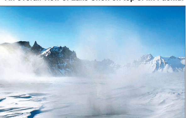
The blizzard on Mt Paektu.